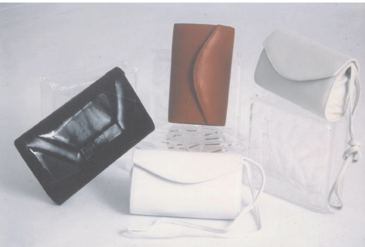
Handbag styles may vary slightly season to season from those pictured.

Classic Pumps offers handbags designed to match our classic shoes. The Californian , made from genuine lambskin leather, is fully fabric lined, has an inside wall zipper, magnetic snap closure, and a versatile 21" shoulder strap that can be tucked into the purse.